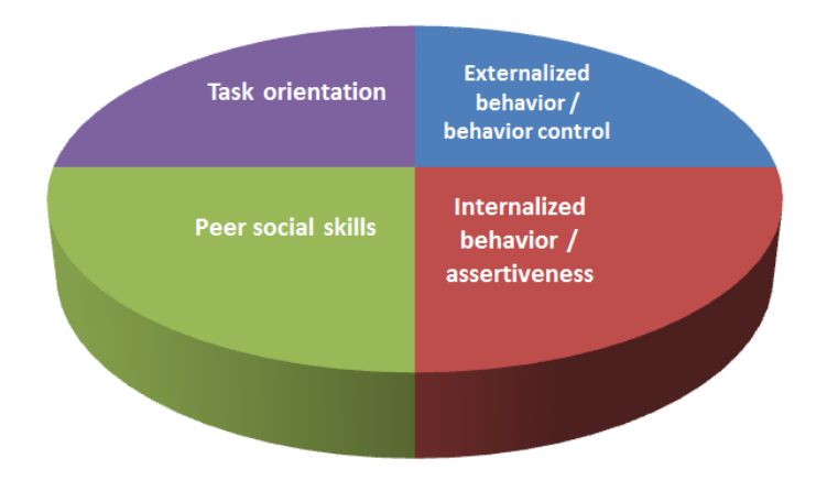
The T-CRS assesses a child's competencies and needs in four domains:

Teachers use COMET to complete the T-CRS easily and quickly online (~2 minutes per child) and the scoring is automatic, allowing data to be accessible immediately. As Brighton continues to track year after year, the district has access to longitudinal data and leverages it to provide the best academic and social-emotional supports for their students as they grow.